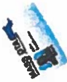
Debit card makes purchases easy!